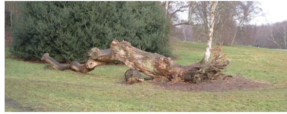
As elsewhere on Hampstead Heath, trees are left to rot where they fall

537 : With the grounds of exclusive properties to your left and right descend the trail, turning more steeply to the left after a short distance. soon you emerge from the woods into the West Meadow . This area forms the western quarter of the Kenwood grounds and includes a gravel cattle track running north south.