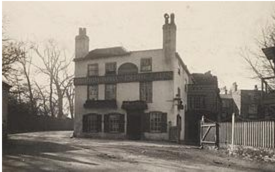
The Spaniards Inn, 1899

continues its search for a new role whilst still impeding the traffic. Both it and The Spaniards are listed buildings.