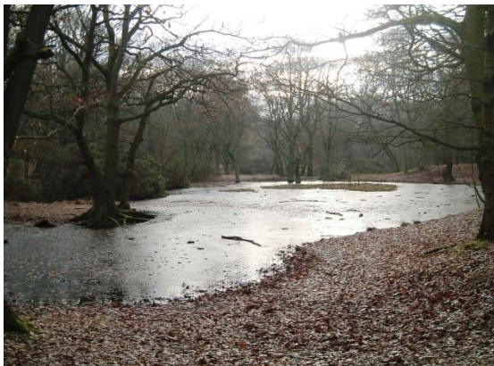
Iron pan ponds

524 : Evidence of the depth of working may be seen by comparing the level of the land with that of the roadway, Spaniards Road, which you can at times see to your right. It is also evident in places where the base of ancient oaks stands more than a metre above the surrounding land, their roots still clearly visible.