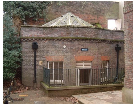
The bath room

Crosfield in the campaign to acquire Kenwood and its estate for the nation.