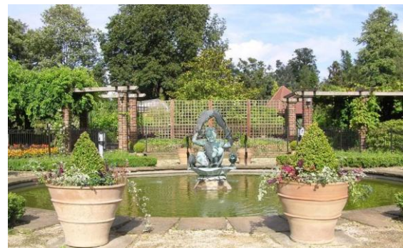
The water garden at Golders Hill Park

502 : Walking downhill from the refreshment centre you soon reach the walled flower garden and a pleasant water garden . Continue along the path and over a hump backed bridge which crosses an ornamental stream .