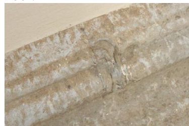
Fossilised oyster shell on a pillar outside the Orangery

548 : Walking around and perhaps across the lawns, back to the terrace you may want to stop outside the orangery to look across Repton’s estate. A fossil oyster shell can be seen at the foot of the left-most pillar of the Kenwood House orangery. The Portland Limestone also contains shapes which are the burrows of creatures that once lived on the sea floor.