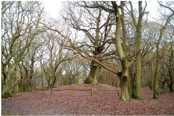
300 year oaks on Sandy Heath

the landscape to one of total despoliation when this part of the Heath entered public ownership in 1889.