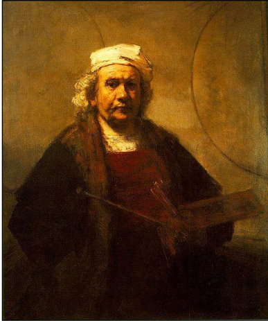
Rembrandt : Self portrait