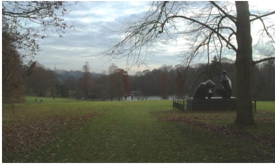
Reclining Figure No 5 looking out over the Kenwood estate

542 : From this point you enjoy an excellent view of the country estate of William Murray , a Lord Chief Justice who subsequently became the 1 st Earl Mansfield. It was his nephew who commissioned the most celebrated landscape designer of the age, Humphry Repton (1752-1818), to re-design the park surrounding Kenwood House. Repton was also consulted over the design of the estate of what subsequently became Golders Hill Park.