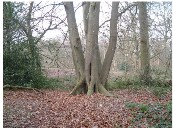
Evidence of coppicing

528 : Towards the end of this easy path are two spectacular coppiced beeches , reminders of the time when this common land was used as a source of timber. Coppicing is a method of woodland management used since medieval times. It involves repeatedly cutting young tree stems down to near ground so that new shoots emerge which after a number of years all more productive harvesting than if the tree had been allowed to grow unhindered.