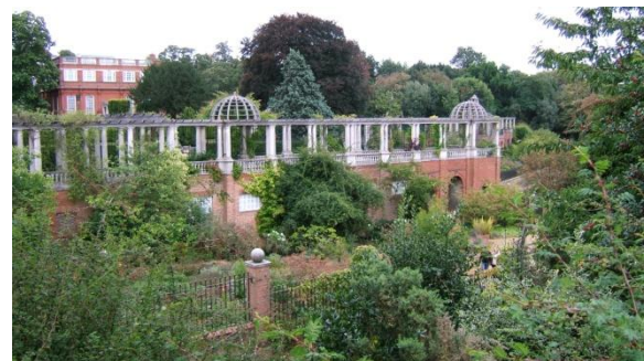
The Pergola, Hill Garden

512 : At the top of the pergola turn to the right where you will find a small belvedere designed to provide a viewpoint across the landscape that John Constable so fondly painted. This view stretched along the Thames valley past Harrow-on-the-Hill as far as Windsor Castle . When the tree tops were lower this scene would often be framed, as Constable’s paintings were, by turbulent cloudscapes driven towards this viewpoint by the prevailing winds.