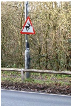
Sign alerting motorists to deer

536 : To continue your walk to Kenwood House retrace your steps past a roadside flower stall, cross the road at the pedestrian crossing, turn right and, after 30 paces, turn left at a small gap in the fence marked by a sign.