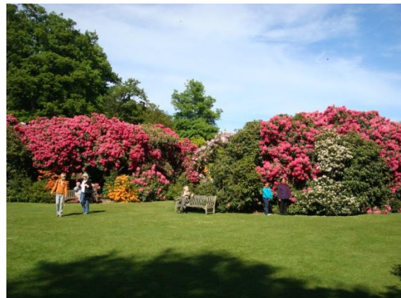
The west garden in May

Kenwood’s acidic sandy soils and provide spectacular displays of blossom in early May.