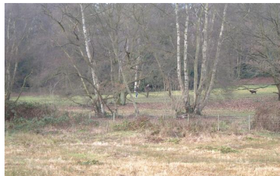
Springs where sphagnum mosses grow

539 : Further down in the fenced off section, sphagnum moss grows in an acidic 'flush' where ground water, trapped by clay in the soil creates spring lines. Given the rarity of sphagnum in this region the area is included within Hampstead Heath Site of Special Scientific Interest.