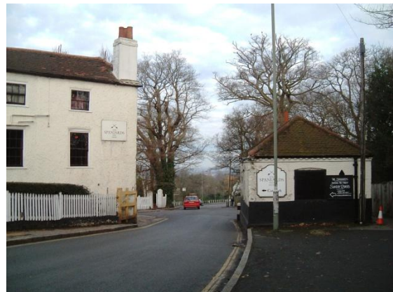
The Spaniards and the toll house

533 : Beyond Heath End House is The Spaniards , an ancient oak panelled inn and tavern, full of character. Built in 1585 as a tollgate inn on the Finchley boundary, it formed the entrance to the Bishop of London's estate. An original boundary stone from 1755 can still be seen in the front garden.