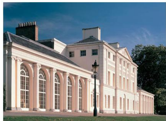
The south facade of Kenwood House

552 : Beyond the cafes is a Ranger's Office where you can find out all about the woodlands, wildlife and management of the Kenwood estate.