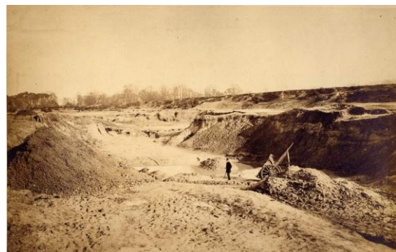
Sand-digging on Sandy Heath, 1867. To the right is Spaniards Road

522 : You will shortly see to your left the first of four small ponds . It is one of the best ponds on the heath for frogs due to its well vegetated and shallow nature.