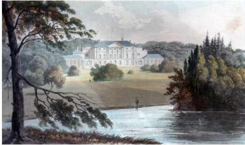
Kenwood House, 1860

549 : The little white bridge to the left of the lake is a single-sided folly, but completes the view seen from the house perfectly. When the estate was laid out it was possible to see ships in the Thames. Today it is difficult to credit you are standing in Europe's largest city.