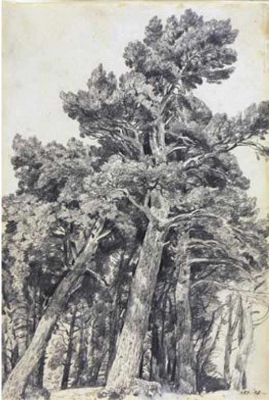
John Constable, 'Fir Trees at Hampstead', 1820.

530 : You reach a main road and a cluster of old houses. The house immediately in front of you is Heath End House , from 1889 the home of Canon Samuel Barnett and his wife, the social reformer Henrietta Barnett (1851-1936).