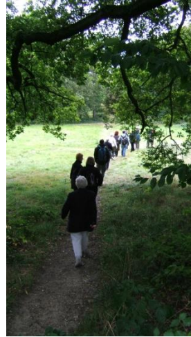
The path as it enters Sandy Heath

519 : Crossing the road, keep to a path to the immediate right of a Corporation of London sign across an open patch of grassland . Continue in the same general direction until you come to more open undulating ground, lightly vegetated except for the occasional mature oak tree.